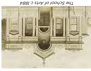
The School of Arts c. 1884

Built in 1884 as a single storey building, the School of Arts operated a library here from 1888 until 1945 when the library service was taken over by Bowral Council. The building was extended with an upper storey in 1913 and Council took over the building in 1938. The Memorial Hall was added in 1961 and convert the building and hall into a performance centre.