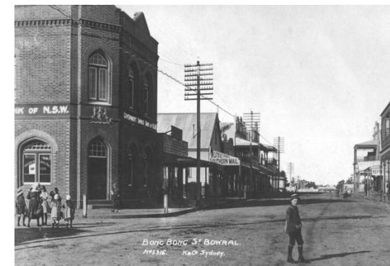
Bong Bong Street, Bowral, 1900 (BDHS)

A self-guided walking tour of the historic town of Bowral in the Southern Highlands of NSW