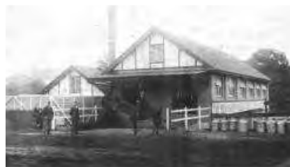
The FF&I Milk Factory c.1921

The Berrima District Farm and Dairy Company was formed in 1895 as a local farmer's co-operative. In mid-1895 this new company acquired the former FF&I Company factory at Nattai (Mittagong) and made it a central butter factory for the district. In 1924, butter operations were transferred here as a new central butter factory and distribution centre. (See photos below and in previous column.)