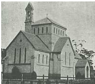
Edmund Blacket's St Simon and St Jude's 1874 (demolished 1886) (BDHS)

After the establishment of Bowral in 1859, John Norton Oxley of 'Wingecarribbee' gifted 43 acres to the people of Bowral for a church, rectory and glebe (an area of open land which could be used to support the Rector). With the sale of the church-school to the Council of Education, the Anglican congregation had no fixed place of worship until 1874 when the first church, designed by Edmund Blacket, was dedicated. The congregation quickly outgrew the church and the present church, as well as the neighbouring hall, was commenced in 1886. The bellcote is the only remaining part of Blacket's church. The organ was built by Sydney organ specialist Charles Richardson and was installed in 1900. The neighbouring rectory was built in 1880. The Church, Hall, Rectory and Cemetery retain a lot of their original setting and together with the Primary School, form an important element in the Bendooley streetscape.