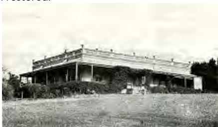
'Wingecarribee' in the late 19th century