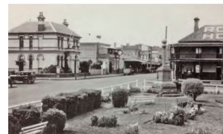
Bong Bong Street looking south from the War Memorial Park c.1920