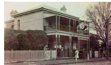
An early view of the Bowral Post Office showing the clock

The first post office on this site was built in 1887 and extended to the street in 1908. The two storey building, which is said to have been the oldest post office in the Southern Highlands, was demolished in 1988 and replaced with a single storey building. Only the clock from the old post office remains.