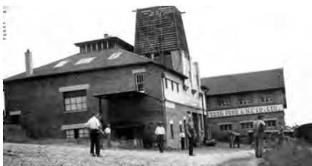
The rear of the Berrima Co-op butter factory (to left of photo) next to the FF&I factory, 1930s (BDHS)

Bowral District milk started being transported to Sydney via the train from 1876. After operating a factory and siding in Mittagong for some time, the NSW Fresh Food and Ice Company (FF&I) built this milk factory equipped with modern refrigeration units and successfully operated it until the late 1940s, when it was bought by Peters Milk. The milk factory ceased operation some time ago and more recently the building has been converted into an art gallery. While the front façade has changed considerably, the building still retains its industrial heritage and was the Overall Winner of the 2009 Wingecarribee Heritage Awards.