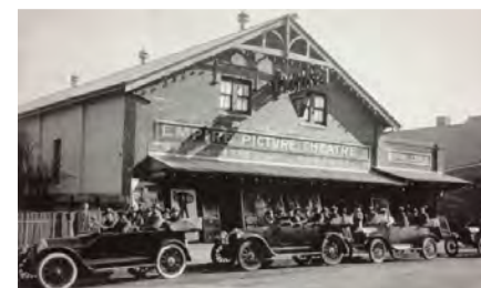
Empire Cinema at its opening in 1915

Opened on 15 September 1915 the Bowral Empire Cinema is the longest running commercial cinema in Australia. The building façade was altered and its roof lifted circa 1938. Although Bowral, Mittagong and Moss Vale all had theatres at one time or another, the Bowral Empire Theatre is the only surviving operating theatre in the Southern Highlands. The entry was moved from the front to the side in the 1980s.