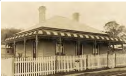
Don Bradman aged 3 outside the Shepherd Street house

The Bradman family lived in this house from the time Don was 3 until he was 15 (1911 to 1924). It was in the backyard of this house that Don Bradman honed his cricketing skills by playing balls bounced from the timber paling fence and the water tank stand. The house has recently undergone a heritage restoration to look like as it did when the photo below was taken in 1914.